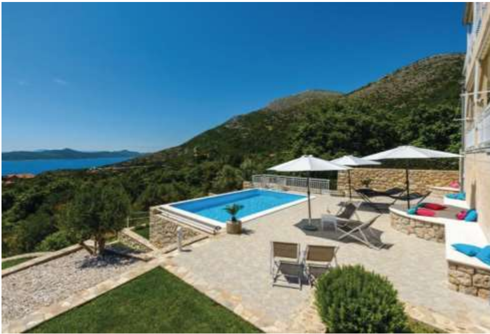
Pool area and terrace