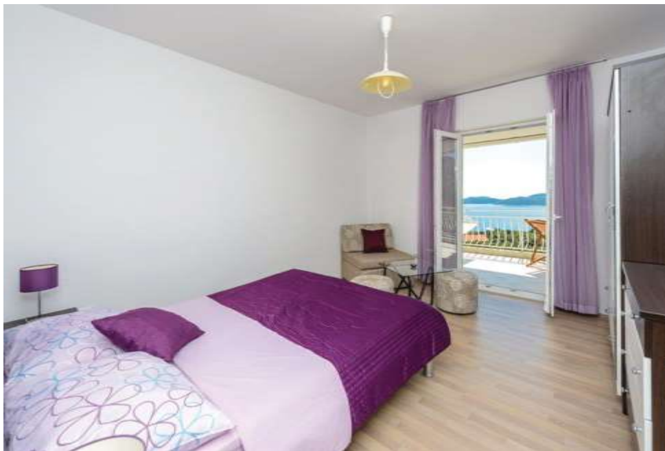
Double bedroom with balcony