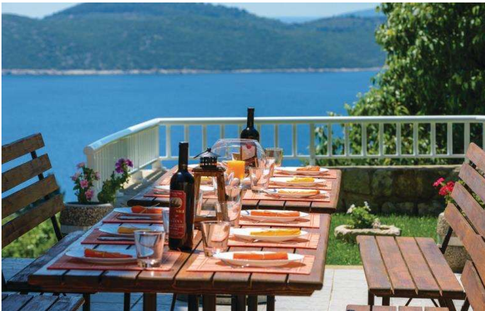
Outdoor dining area