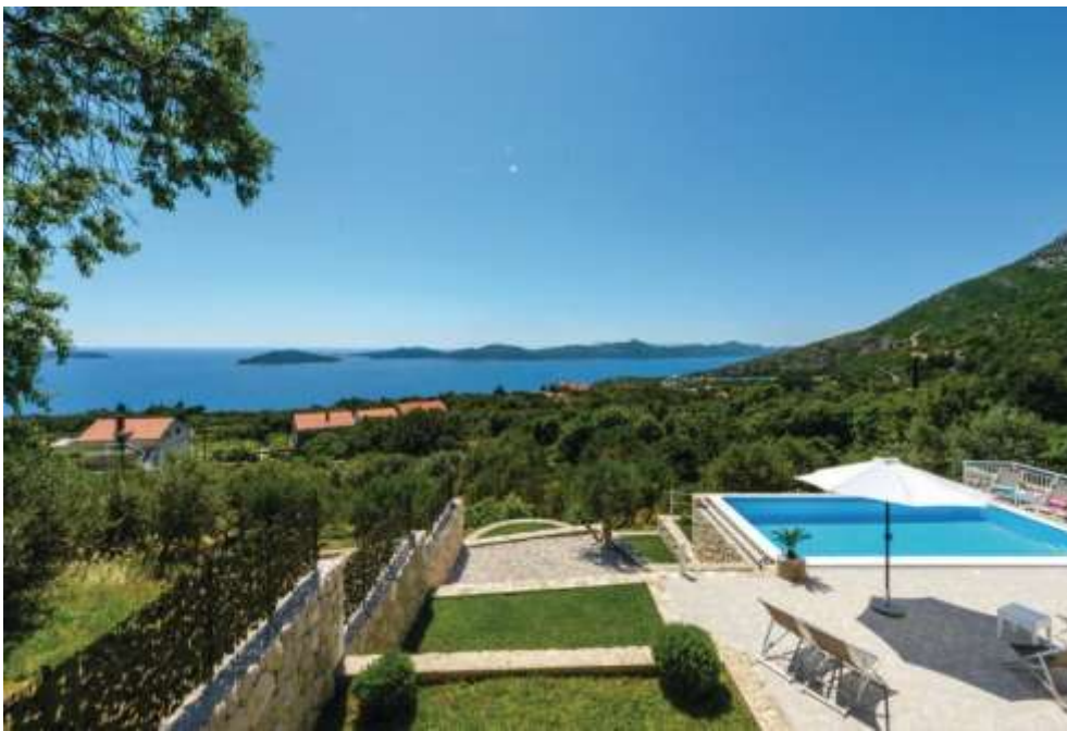
Exterior & sea view