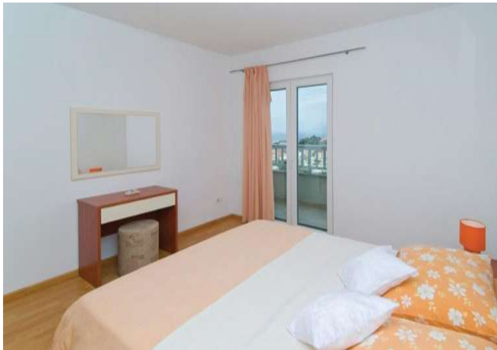
Double bedroom with balcony