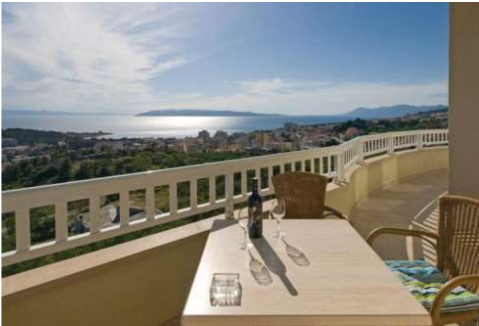
Exterior balcony area