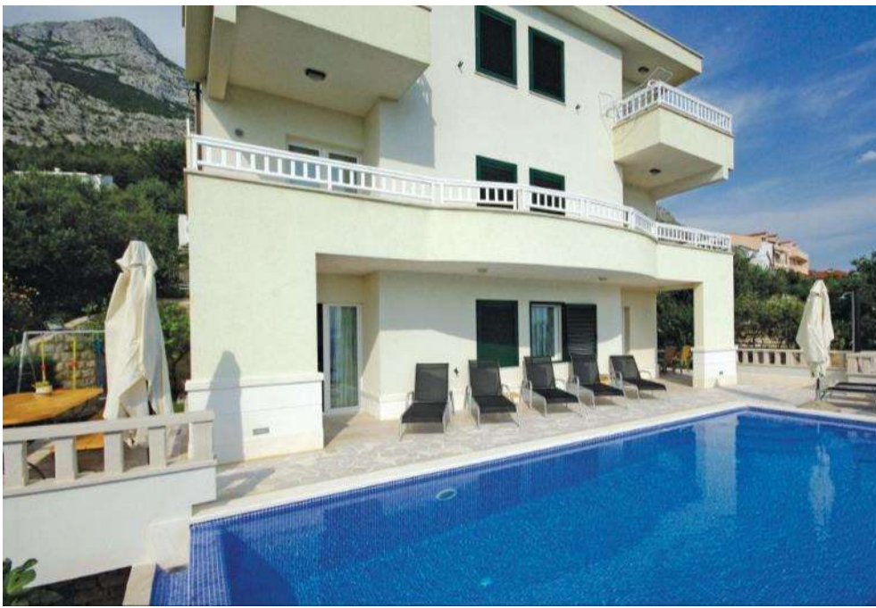
Exterior & pool area