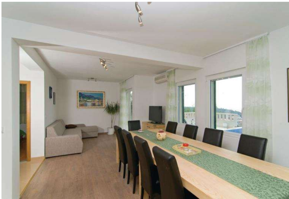
Open plan living/dining area