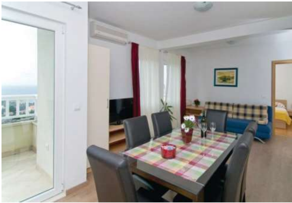
Dining area with balcony