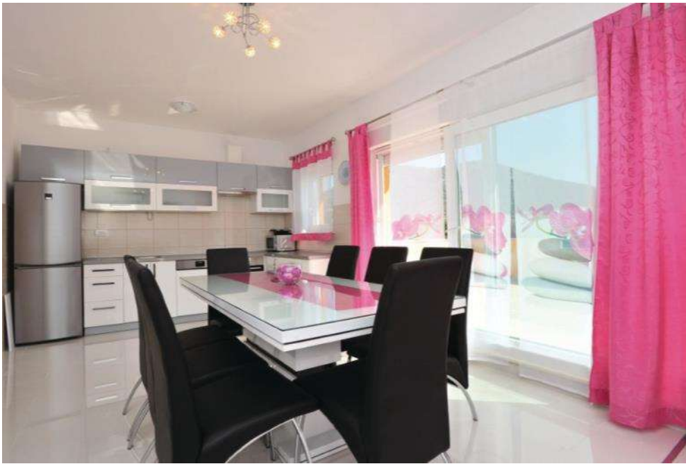
Open plan kitchen/ dining area