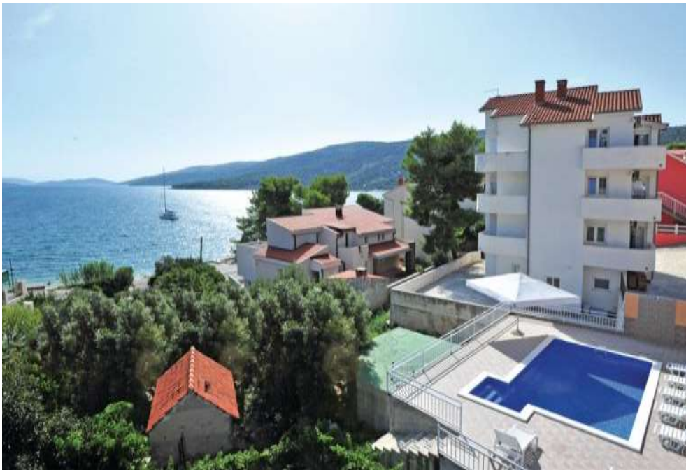
Pool and sea views