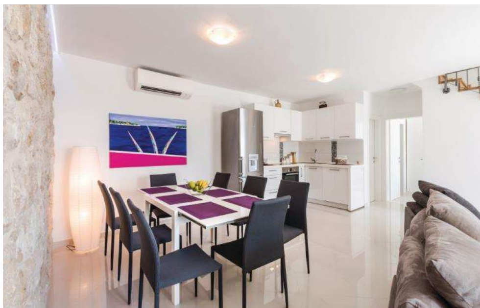
Open plan living/kitchen/dining area