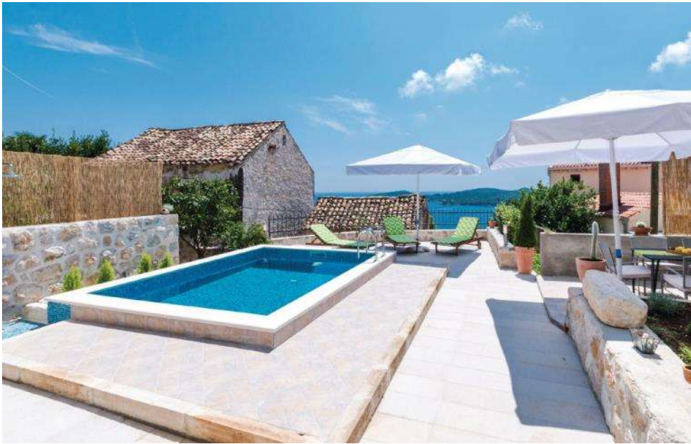
Exterior & pool