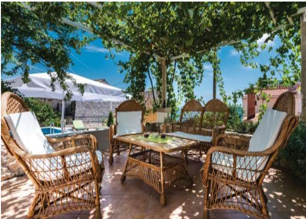
Exterior dining area