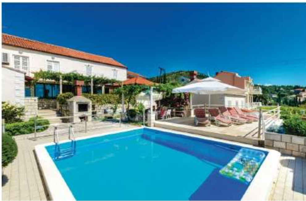
Exterior & pool