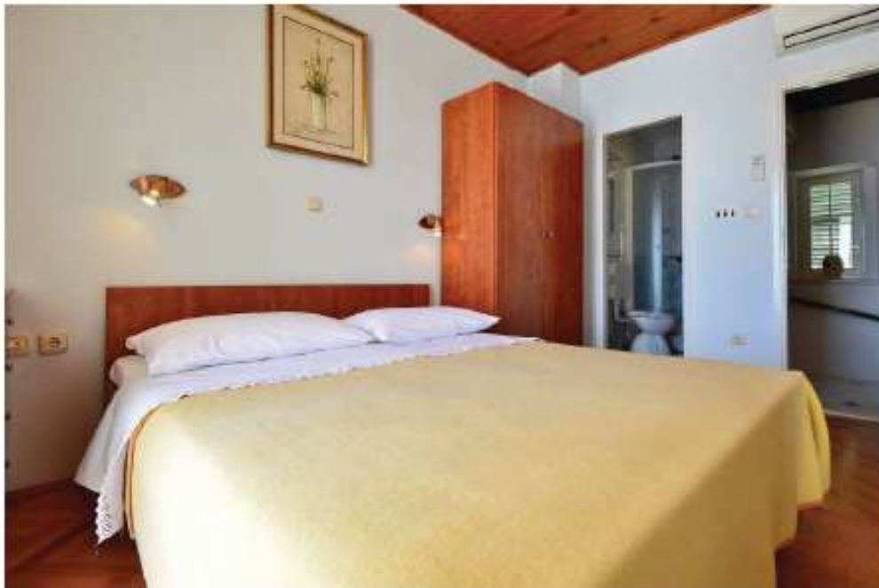
Double bedroom 1