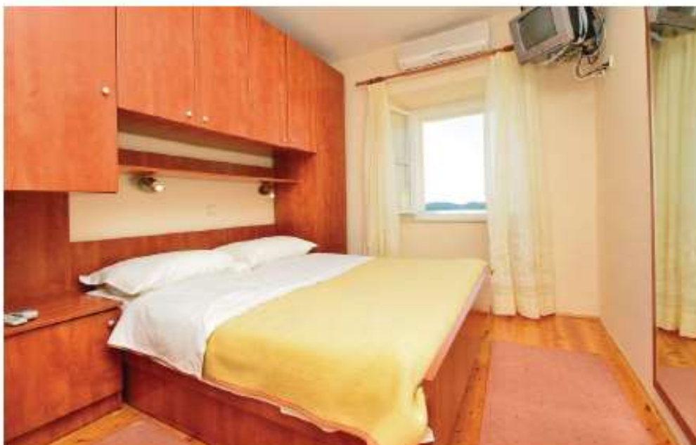
Double bedroom 2