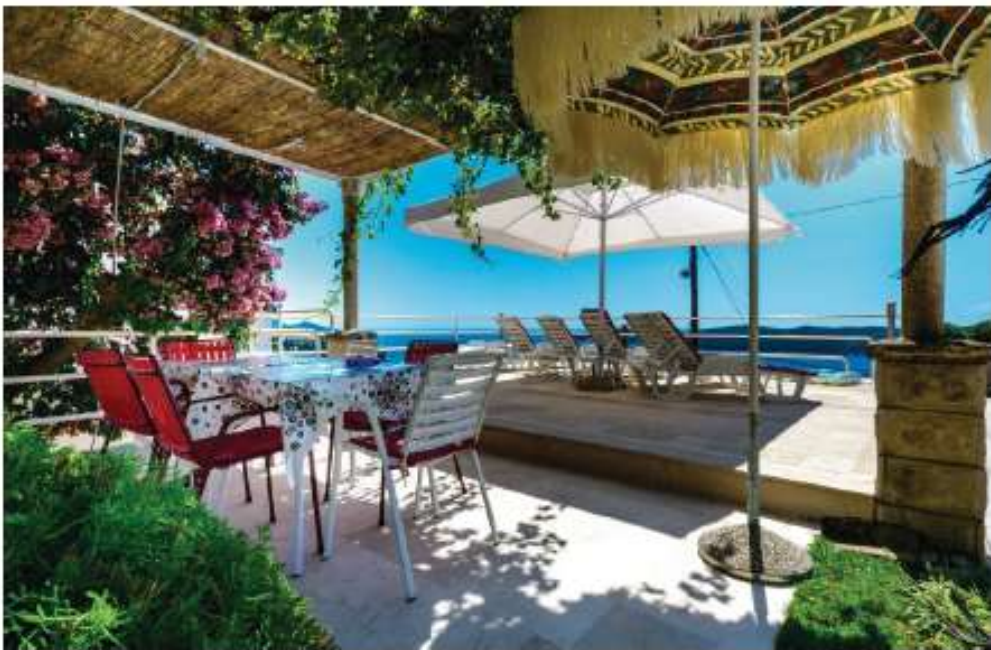
Exterior dining area