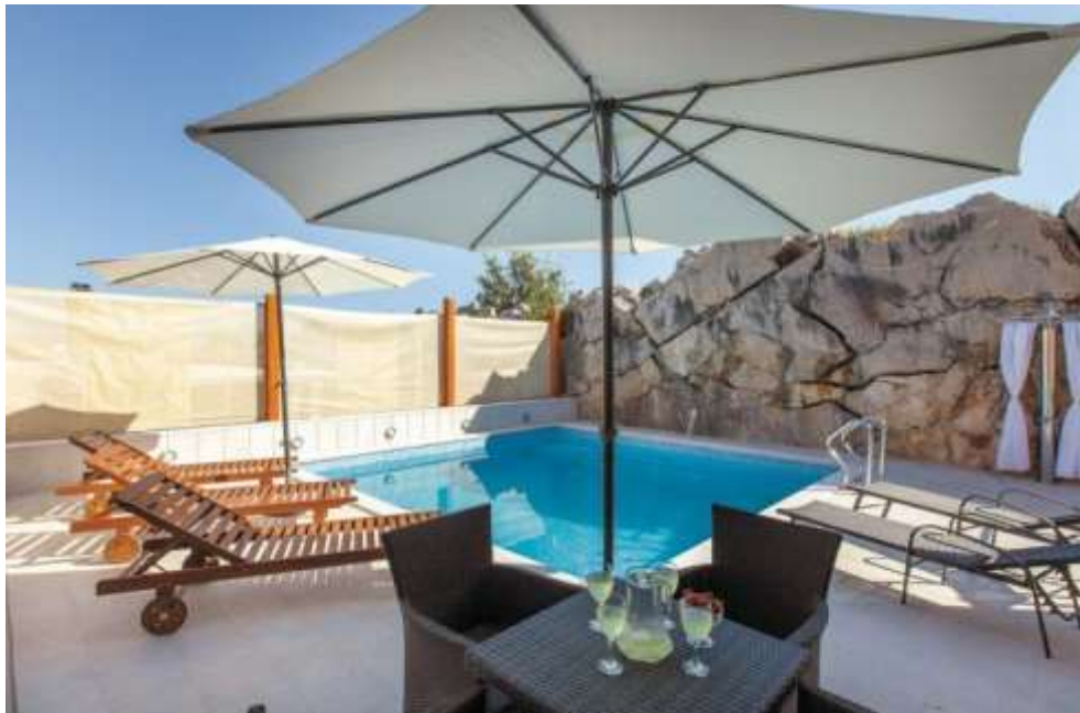
Pool & dining area