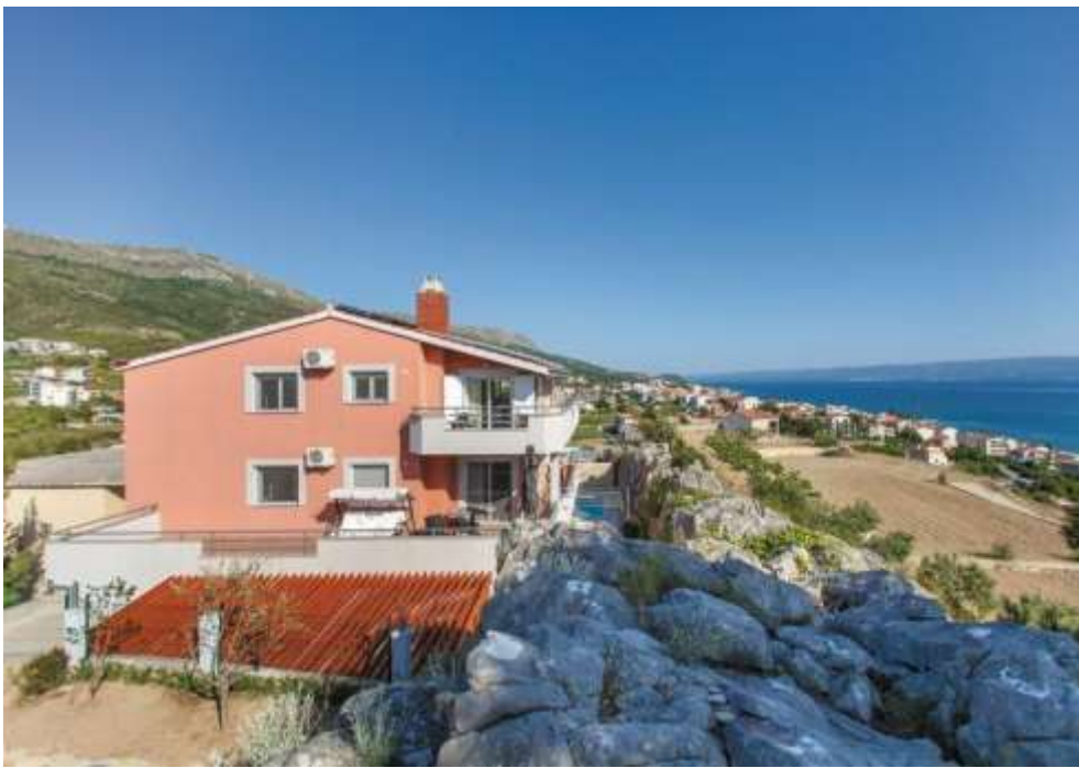
Exterior & sea view