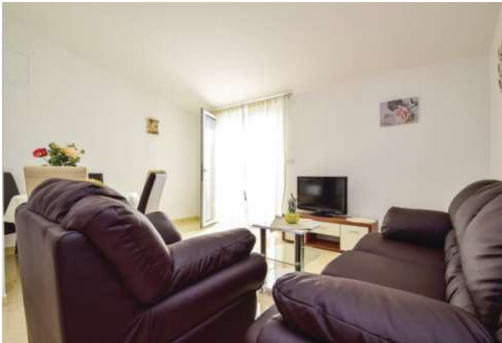
Open plan living/ dining area